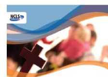
Church Life Survey Workbook

A Catholic Digital Edition of the Workbook , available for download from the NCLS Research website, aims to help each parish to explore and understand the survey results. It offers processes to help leaders and the whole parish to respond to the unique results and form future directions. The Workbook is part of the Church Life Pack of resources that parishes receive after completing a Church Life Survey . It is a companion document to the Church Life Profile of survey directions. Gaining the feedback of Mass attenders via a Church Life Survey is the first step of the process. Taking some actions based on the results is essential to completing the process through the three steps: evaluate results, communicate insights and findings, and then act on the goals formulated in response to the survey learnings.